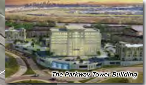
The Parkway Tower Building