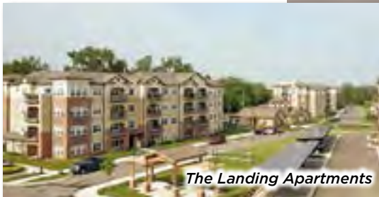
The Landing Apartments